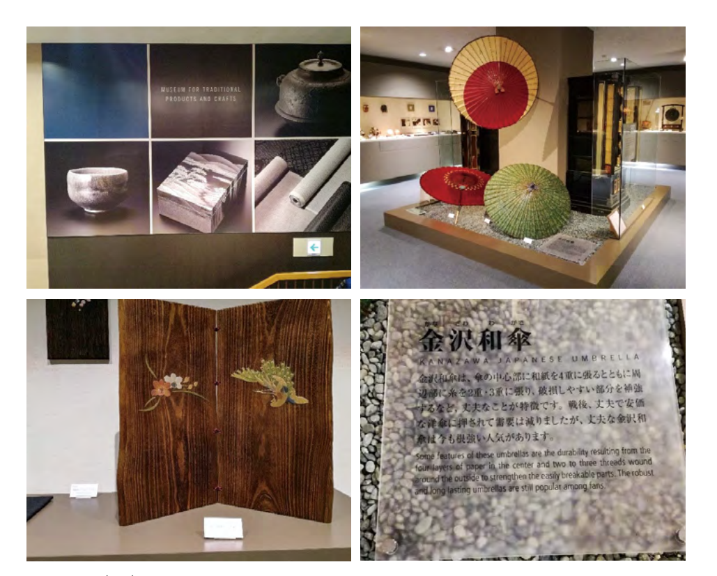
Figure 24 (a-d). Artworks and crafts that are tastefully displayed at the Museum of Traditional Arts & Crafts. Descriptions are bilingual in Japanese and English to cater to foreign visitors.

From Figures 24 to 25 below, it is evidential that Kanazawa not only has many museums, but they are also high quality ones. No doubt, a visit to any of Kanazawa's museums is a worthwhile endeavour for both local people and visitors alike. The researcher's visit to the above nine museums confirms that great attention to details and thorough research and development (R&D) have been channelled into curating, displaying and exhibiting the relics and artifacts that best portray the overarching theme of each individual museum. To cater to foreign visitors who are non-native speakers, the provision of English texts to explain each piece of relic/artifact was a commendable effort by museum authorities. Many of the museums/galleries in Kanazawa have successfully presented and interpreted the past history, "story," and the role and function of each priceless piece of relic/artifact on display.