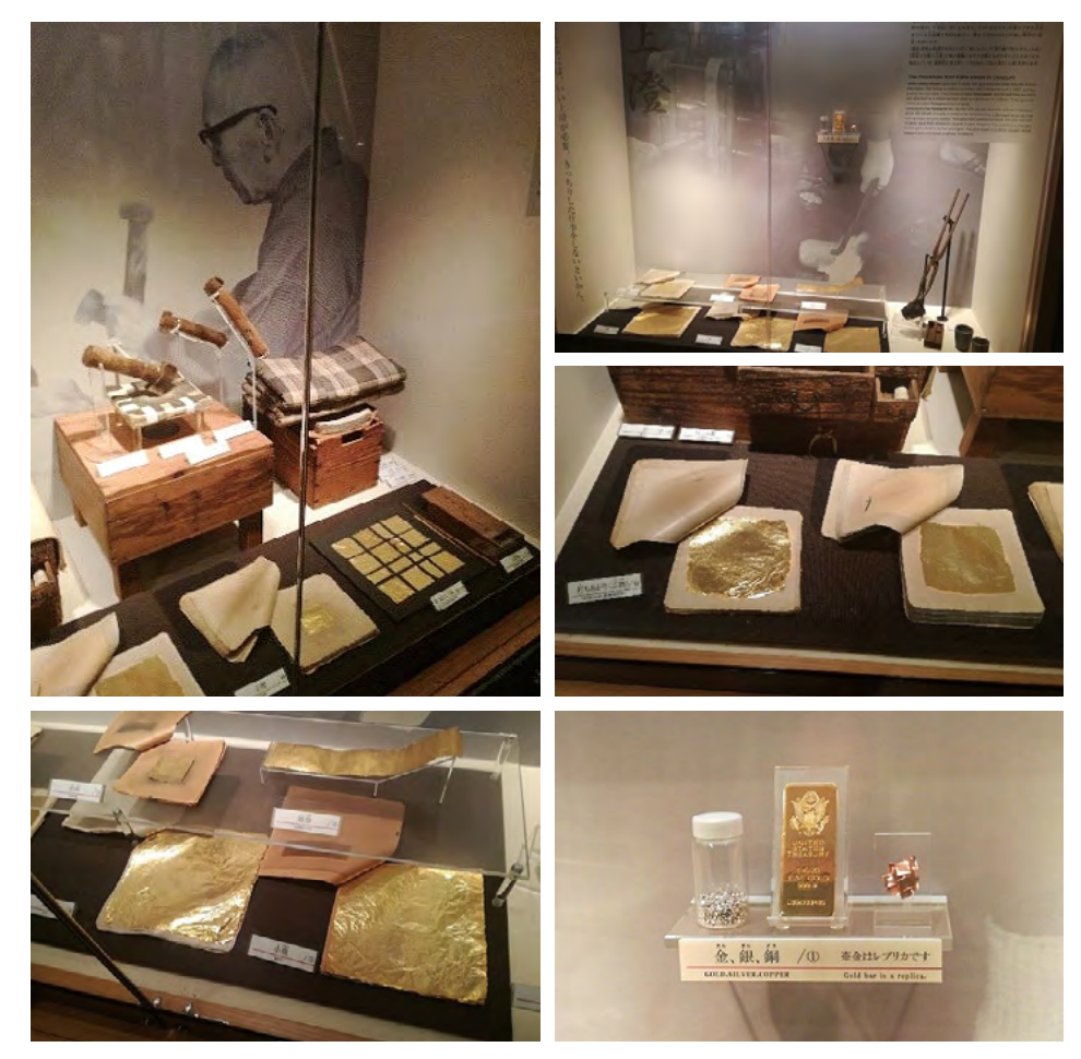
Figure 13 (a-e). The step-by-step process of manufacturing gold leaf.

A rather similar scenario was depicted in the gold leaf industry. When interviewing the Director of Gold Leaf Museum, he explained the detailed and painstaking processes and procedures involved in producing an ultrathin piece of gold leaf and these steps are still followed by artisans today. This revelation shows the great patience, perseverance and pride that artisans in Kanazawa have towards their work and creations. Figures 13 (a-e) and 14 illustrate the tedious steps involved.