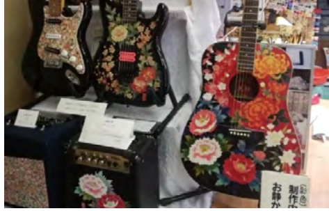
Figure 8. Hand-drawn kimono designs on Figure 9. Innovative way of infusing modern products—a form of innovation.