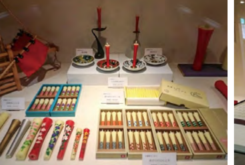
Figure 28. Excellent packaging and marketing of Japanese candles.

During the fieldwork observation in Kanazawa, the researcher found that shops situated in the city's historic districts, gardens and museums emphasized and put a lot of care into packaging, branding and marketing the city's creative and cultural products (see Figs. 28 and 29). The attention to details and care that are directed into designing, decorating, packaging, branding and marketing Kanazawa's creative and cultural products are commendable and should be emulated by other cities as part of their industrialisation strategy.