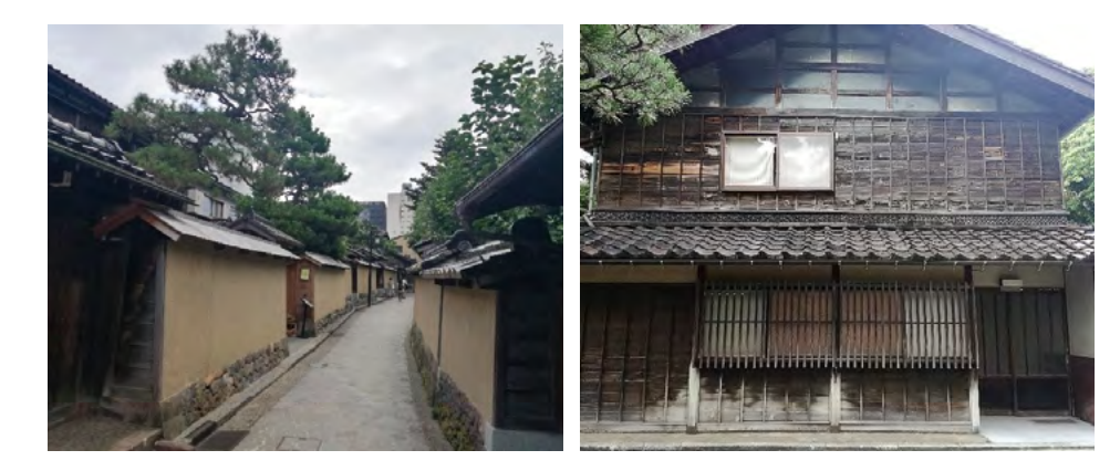
Figure 20 (a-b). Site visit to Nagamachi District featuring Samurai houses.

One good example is the Kenrokuen Area Cultural Zone. As depicted in Figures 21-23, there is easy accessibility, wide availability and close proximity of cultural institutions such as museums and galleries open to the general public, with each cultural institution located within the radius of less than one kilometre from one another. From the plans and signage, it is clear that cultural institutions like the Ishikawa Prefecture Museum of History, Ishikawa Prefecture Museum of Art, Ishikawa Prefecture Noh Museum, Ishikawa Prefecture Noh Theater and Ishikawa Prefecture Museum of Traditional