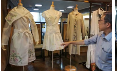
Figure 10. Hand-drawn kimono designs are innovatively infused into modern women's attire.