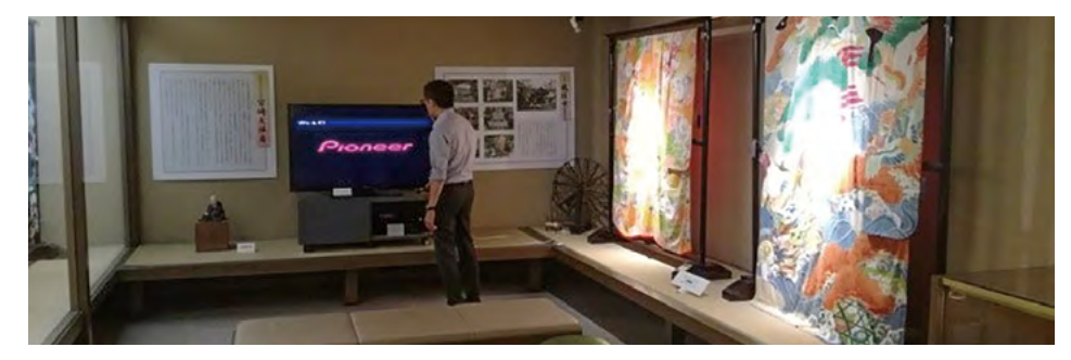
Figure 12. Video viewing area for the public at Kaga Yuzen Kimono Center. The video illustrates the step-by-step process of kimono-making as means of transmitting knowledge.

A rather similar scenario was depicted in the gold leaf industry. When interviewing the Director of Gold Leaf Museum, he explained the detailed and painstaking processes and procedures involved in producing an ultrathin piece of gold leaf and these steps are still followed by artisans today. This revelation shows the great patience, perseverance and pride that artisans in Kanazawa have towards their work and creations. Figures 13 (a-e) and 14 illustrate the tedious steps involved.