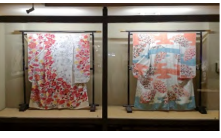
Figure 6. A kimono artist who takes great Figure 7. Hand-drawn works by kimono pride in his work. © Suet Leng Khoo