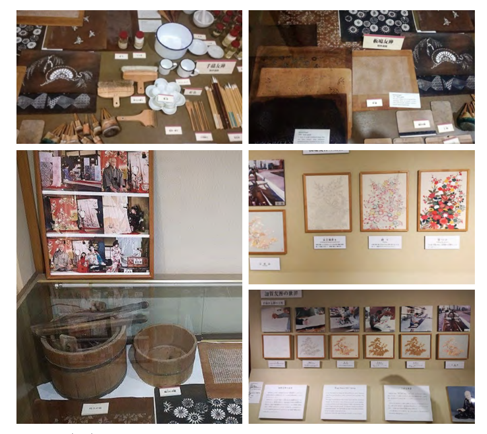
Figure 26 (a-e). Kaga Yuzen Kimono Center conducted excellent documentation of the way a hand-made kimono is produced. This local knowledge can then be transmitted to apprentice artisans.

The step-by-step documentation of each artisan/craftsman's works was meticulously recorded, documented and displayed in this museum. This approach is a sustainable way to preserve and safeguard the skills and local knowledge of traditional artisans and craftsmen, regardless of whether the person is still alive or not. Even the Kaga Yuzen Kimono Center has a small gallery that showcased the detailed documentation of how a piece of handdrawn kimono is produced as shown in Figure 26 (a-e).