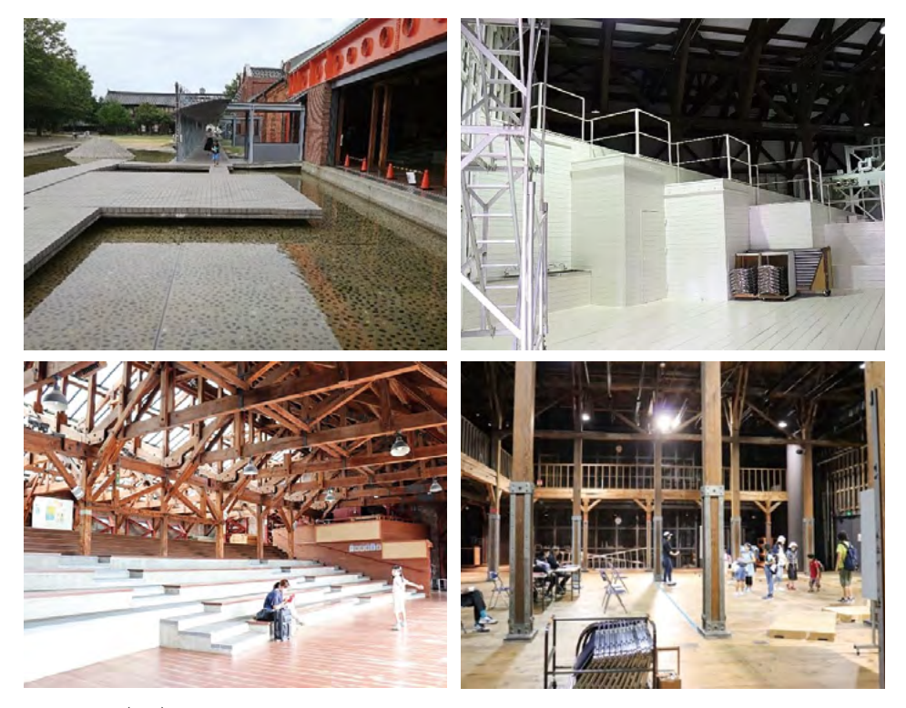
Figure 27 (a-d). Various types of space available for arts and cultural activities at Kanazawa Citizen's Art Center where creative transmissions of culture and creativity occur.

and place for arts, heritage and cultural activities. The center is open 24/7 to the general public and the space is rented out at minimal rates for people to organise arts and cultural activities, or simply for musicians to practise their instruments (i.e. piano, electric guitar, Taiko drums). The center's tag line is "for the people, by the people" indicating strong participation and involvement by local communities in Kanazawa towards advancing and appreciating arts and culture. A bottom-up, grassroots, citizen's participation approach is evident given that the center is administered and managed by citizens themselves and for other fellow citizens. Box 1 and Figure 27 (a-d) illustrate the Kanazawa Citizen's Art Center in greater detail.