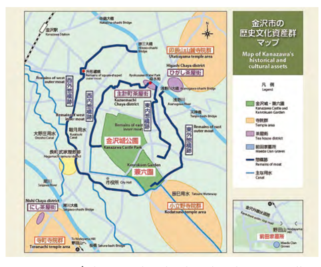
Figure 15. Kanazawa's historical and cultural endowments illustrated through the city's temple areas, tea house districts and gardens.

The city of Kanazawa is a physically well-planned city where there are distinctive zones with specific themes such as gardens (i.e. Kenrokuen Garden, Kanazawa Castle Park), tea houses (i.e. Nishi Chaya District) and temple districts as shown in Figures 15-20 below. Apart from being UNESCO's Creative City, Kanazawa was earlier accoladed as a historical city in January 2009 due to the city's distinctive cultural activities, built heritage and historic urbanscape (Kanazawa City 2018, 11). As a foreign researcher undertaking fieldwork in Kanazawa, it was not difficult to navigate around the city given that there were ample notice boards, signage, brochures and tourism counters/kiosks to provide information to tourists and visitors. Although the researcher is a non-native Japanese, it was relatively easy to move around Kanazawa because almost all signage and notice boards were written in dual languages of Japanese and English.