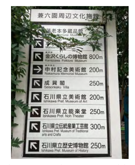
Figure 22. Integration of natural heritage (i.e. gardens) and cultural heritage (i.e. museums) at Kenrokuen Area Cultural Zone. © Suet Leng Khoo

Figure 23. Cultural institutions such as museums and theatres are closely clustered within the radius of less than 1 kilometer from one another. An example of a clear signage with dual languages of Japanese and English. © Suet Leng Khoo