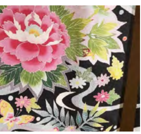
Figure 5. Works by kimono artist. © Suet