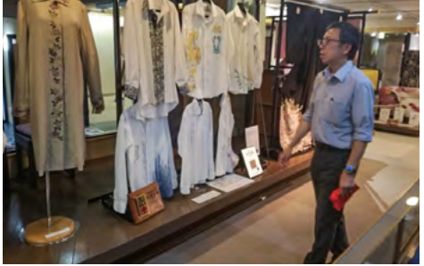
Figure 11. Hand-drawn kimono designs are innovatively infused into modern men's attire.