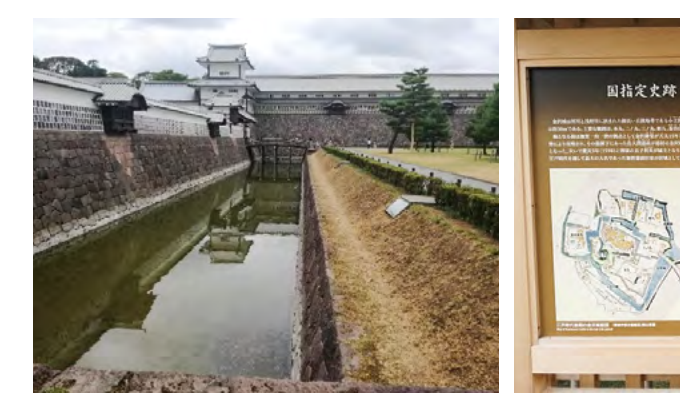
Figure 19 (a-b). The Kanazawa Castle Park.