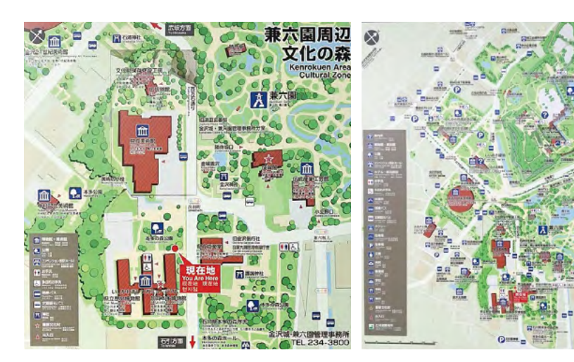
Figure 21. Close proximity of museums around Kenrokuen Area Cultural Zone.