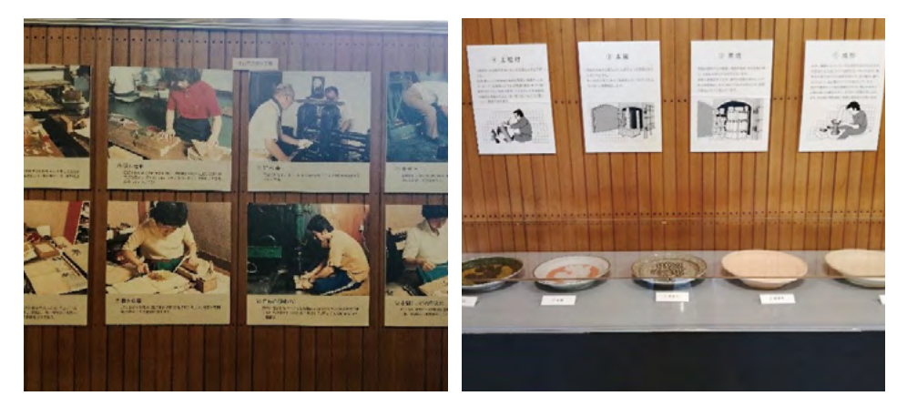
Figures 25 (a-b). Meticulous documentation of traditional craftsmen's works at the Museum of Traditional Arts & Crafts.

In the Museum of Traditional Arts & Crafts, for instance, great efforts have gone into documenting the works of traditional craftsmen and this endeavour is a creative transmission of cultural skills. The skills and local knowledge of these traditional artisans and craftsmen are intangible cultural heritage and location-specific because they are distinctive and found only in Kanazawa. These traditional artisans and craftsmen are key towards Kanazawa's inscription as UNESCO's Creative City of Crafts and Folk Arts.