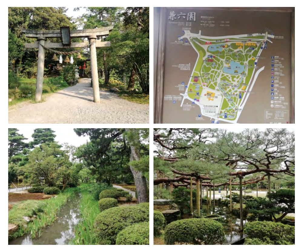
Figure 18 (a-d). The Kenrokuen Garden.