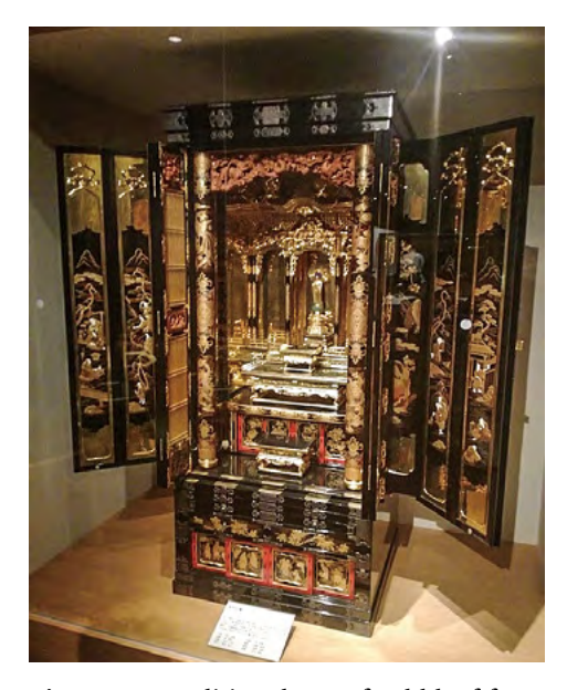
Figure 14. Traditional use of gold leaf for Buddhist altars in Japanese households.